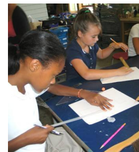
Two seventh grade girls prepare to draw their sky scrapers in art class.

conover123@verizon.net . Don't miss this great opportunity to spend time with St. Anne's Episcopal community.